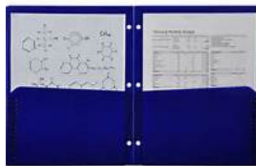
2 - 2 pocket plastic folders