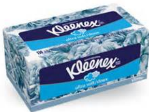
2 boxes of Kleenex