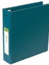
2 inch Solid color Binder (no zip binders)