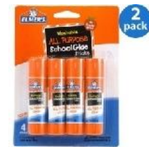
1 package - glue sticks