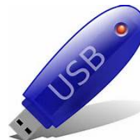
Memory Stick (with hole to hang)