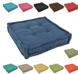
1-solid color square floor pillow or 1-box air dry clay (natural color)