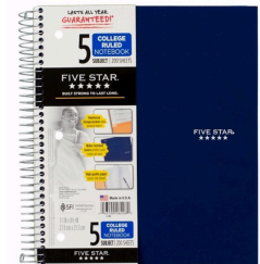
5 Subject Spiral Notebook