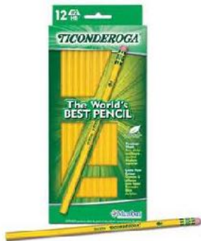
1 dozen #2 pencils (yellow only)