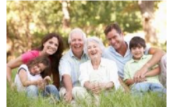
Family photo not in a frame